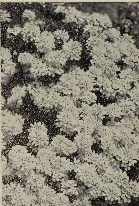
Iberis sempervirens (Candytuft). See page 7

⊙ Golden Ball. A useful border plant and Summer cut-flower. Dwarf yellow flowers from June until October. 12 in. 75 cts. for 3, $2.00 for 10, $3.75 for 25.